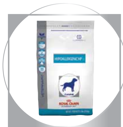
Available in a 6 lb, 16.5 lb, and 32 lb bag.