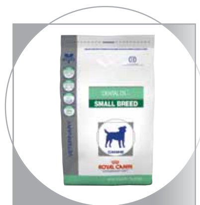
Available in a 7 lb bag.