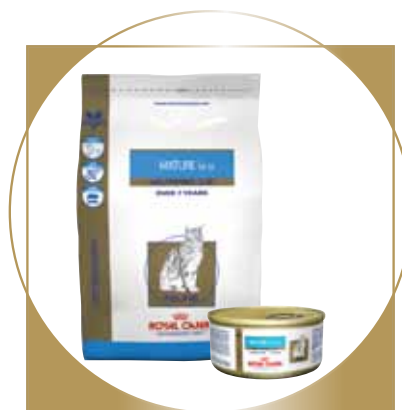
Available in a 6 lb and 16 lb bag and 5.8 oz can.