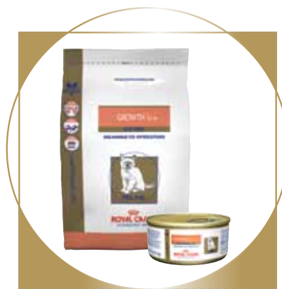
Available in a 3 lb bag and 6 oz can.