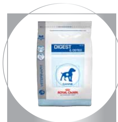
Available in a 6 lb and 30 lb bag.